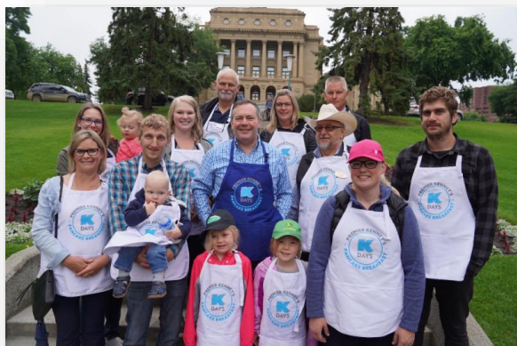
Premier Jason Kenney with SM5 Farmers