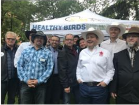
SM5 Farmers with Premier Jason Kenney